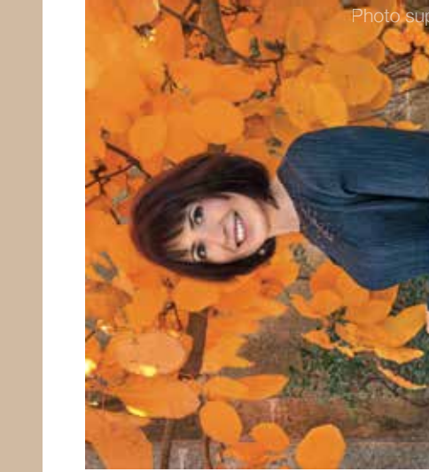
Photo supplied by artist